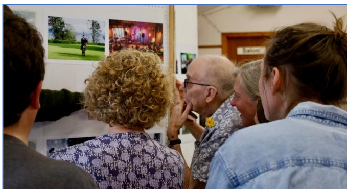
The exhibition in Ardasar Hall last summer showed the many ways that the community and CDLT connected.

Armada helped create community spirit. Support from the community has been behind the success of CDLT.