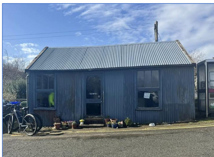
"Found the fab Cafe 1925 on Skye. We recommend this place very highly" – from the Corrugated Iron Appreciation Society