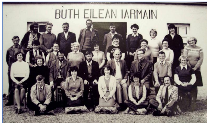
Thank you Skye and Lochalsh memories

This historic photo, from the early 1980s, popped up on Facebook as we were laying out the newsletter.